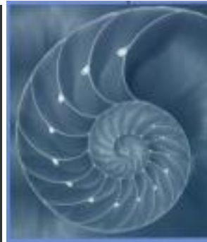
The Nautilus Shell