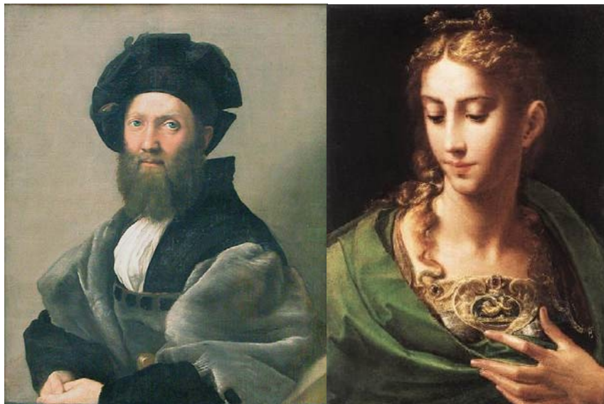
Kuthumi, as Balthazar and Pallas Athena as Lady Athene

We show you the great depth of our compassion for you in the outpicturing of one manifestation of our former Incarnate Forms: